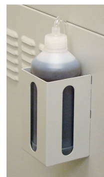
Optional EvenFlow™ Automatic Oiling System